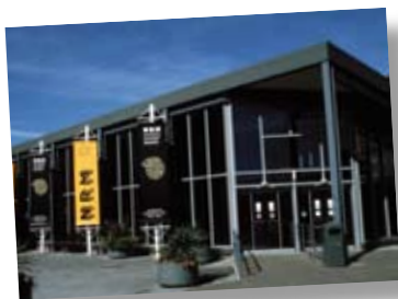
The National Railway Museum in York

Estonia, Denmark and the Netherlands. The group worked on employee relations language and communication, and policy development for the EWC, and made contact with local trades unionists as well as going on a specialist guided tour of the National Railway Museum. Plans are now afoot for a follow-up course in 2008.