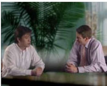
A still from the DPI video

After attending a three-day workshop, trainers are given a set of video, audio and text materials which can support their own training programmes. The last one of the year was run on the premises of the Audi Akademie in Ingolstadt. In 2008, we have three workshops scheduled for York (26-28 February, 20-22 June and 14-16 October) and are planning several on-site workshops in France, Sweden and Germany. Visit the website or contact us for more details.